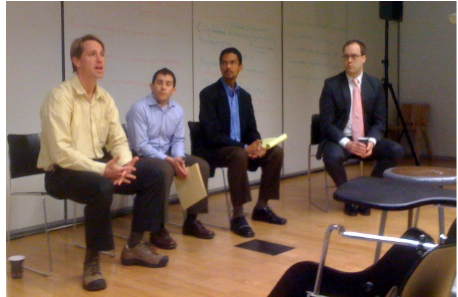
Above: the speakers from the Cost & Maintenance Workshop spoke about the need for more data on Green Infrastructure and opportunities for jobs for local residents. Below: educating the residents and the preschool families at West 834d Street was an important part of the project. The District developed a curriculum for the preschool teachers and offered a workshop for teachers.

As part of the NPDES Stormwater Phase II regulations, the District has hosted training sessions for professionals responsible for inspecting construction site erosion and sediment control practices. The training is given by a CPESC who is authorized by the NYS Dept of Environmental Conservation and attendees receive certificates of training. The District has hosted public training sessions as well as private sessions in response to requests.