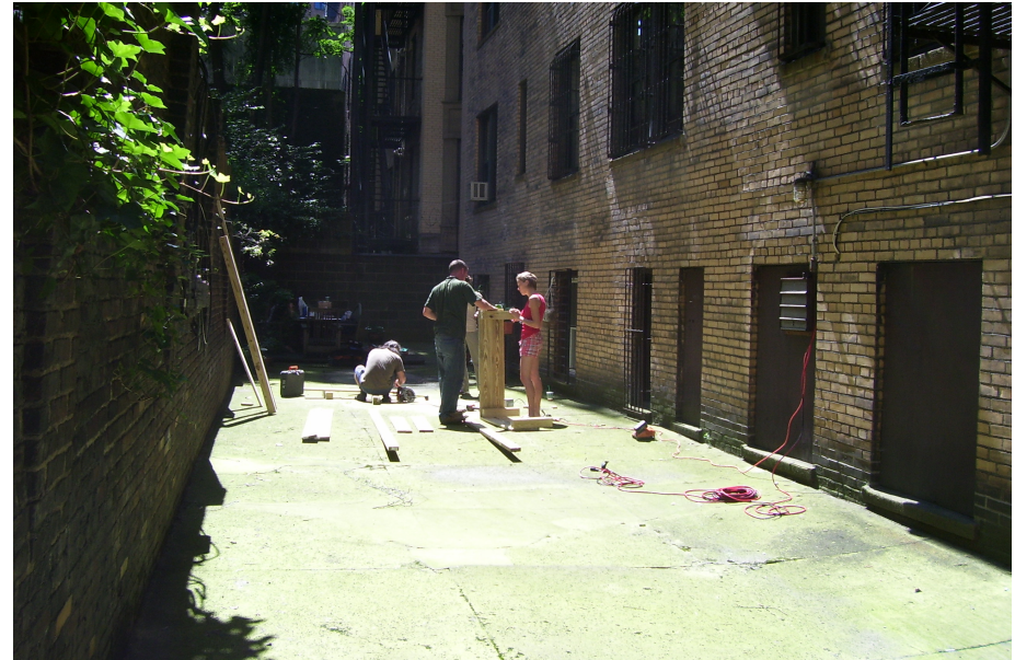
Above: the project site before construction had very little greenery. Below: three small planters and one large planter were constructed. The large planter has integrated benches. All plants are native shade tolerant species. Far left: Blue wood Aster thriving in a planter.

The District worked closely with the Co-op board in the design of the planters. The residents who used the backyard frequently maintained the planters. The building superintendent was asked by the Co-op board to water the plants during the first summer. During the summer of 2010, the superintendent only watered them when there was a dry period. Because the plants are native species, they require very little maintenance.