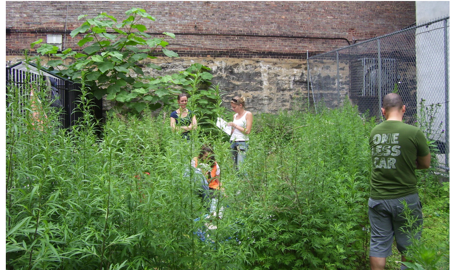
Above: the site was infested with Mugworts nearly five feet high and strewn with trash. Below: after weeding, a ditch was dug out for a wetland. Holes on the left were dug with a jackhammer. Because of the location of the site, removal of the top layer of soils was not possible. Far left: the site was planted with all native species. Inside the ditch, wetland species were planted.