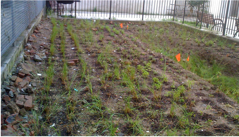
Above: 2" plugs were planted into holes with a mixture of native soil and mulch. The site was irrigated for several weeks. Below: by October, most plants were thriving. However, small patches of mugworts were also returning. The barrel in the middle is a sump that controls the flow of rainwater from the rain barrels outside the fence. Below right: after a rain, the ditch is filled with rainwater, which infiltrates into the ground. When the sump signals the maximum volume, a valve shuts off the flow to the sump and barrels begin to fill. When both the wetland and barrels are at capacity, the flow is diverted back to its original course (directly into the sewer system).