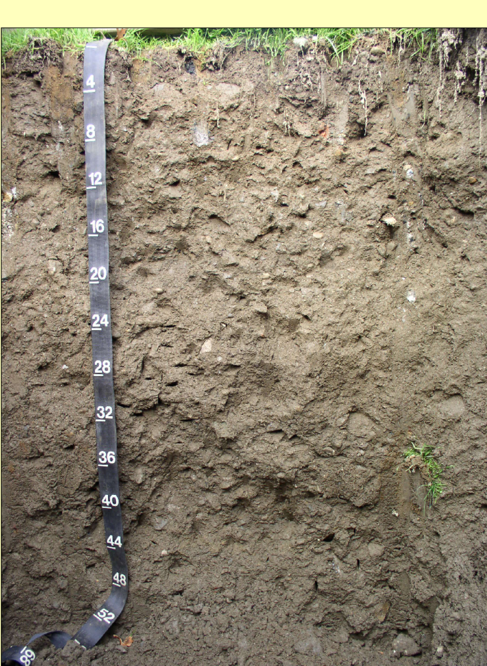
186. Greenbelt soil, Woodman Cemetery, Bronx