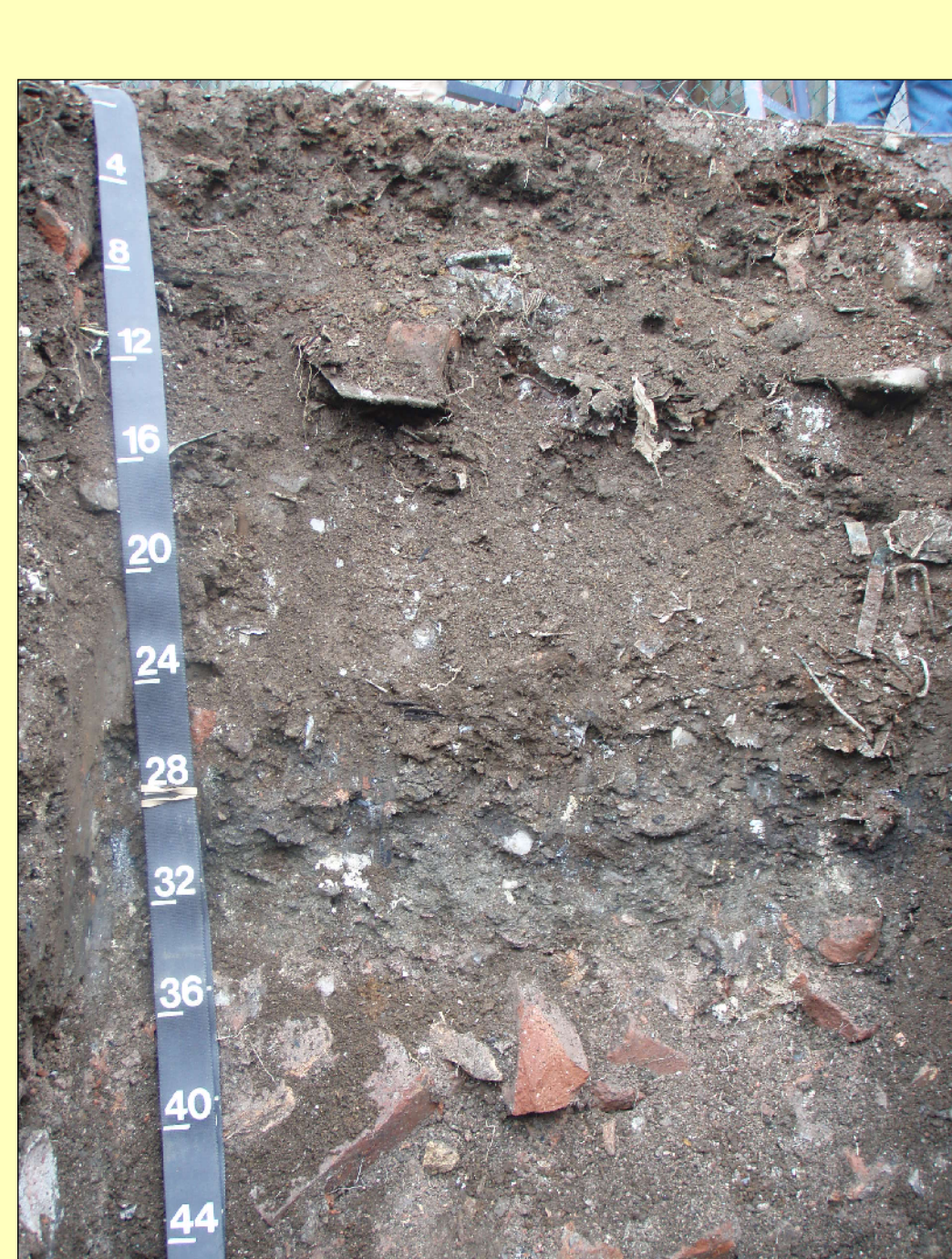
220. Laguardia soil, Hunts Point, Bronx