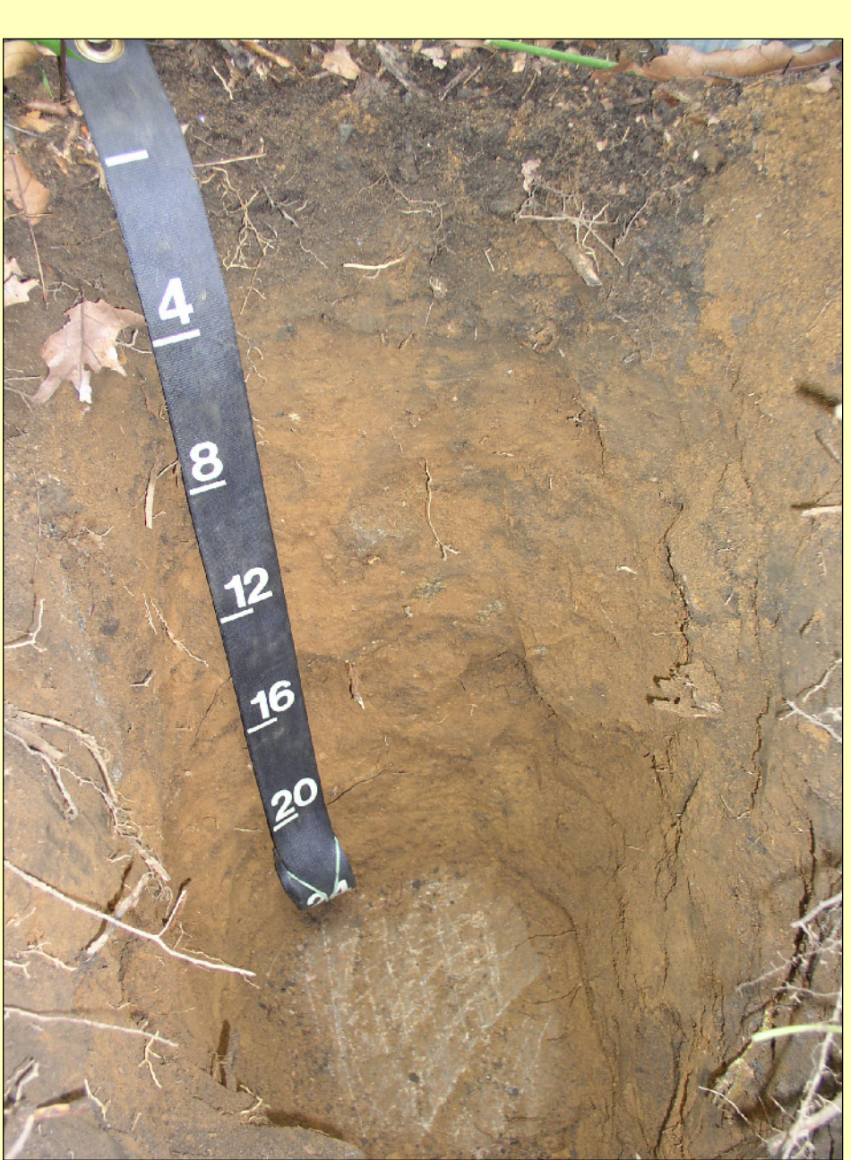
76. Chatfield soil, NY Botanical Garden, Bronx