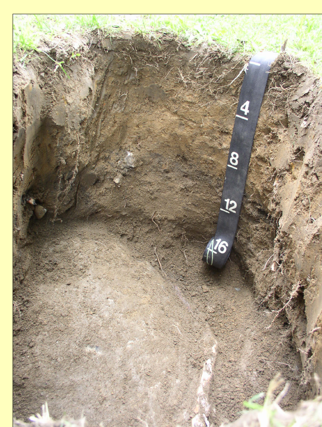
4. Centralpark soil, Pelham Parkway, Bronx